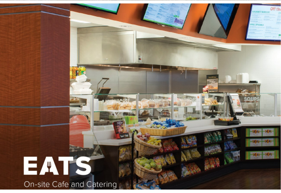
EATS On-site Cafe and Catering