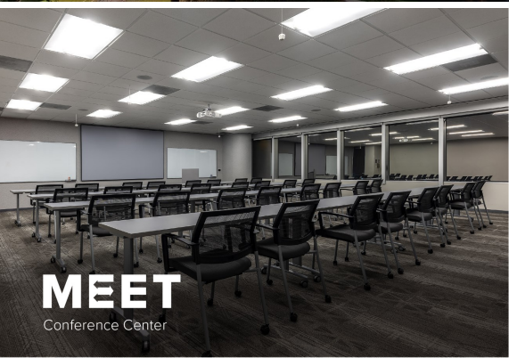
MEET Conference Center

Granite WESLAYAN TOWER 24 GREENWAY PLAZA