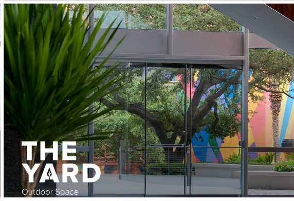
THE YARD Outdoor Space